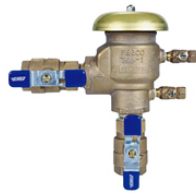
Pressure Vacuum Breaker Assembly (PVB)