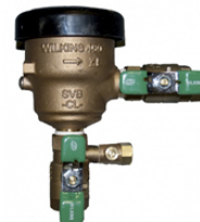
Spill-Resistant Pressure Vacuum Breaker Assembly (SVB)